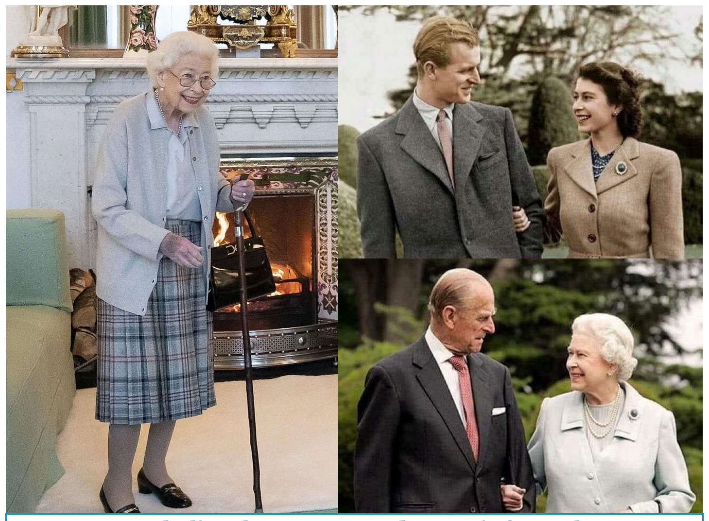
Catholics chosen to attend Queen's funeral